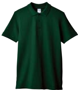
33C Forest Green