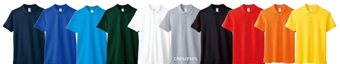
32C Navy 51C Royal 26C Sapphire 33C Forest Green 30N White 295H RS Sport Grey* 36C Black 40C Red 37C Orange 98C Daisy

Double vents and double needle stitching at hem for better shape retention.