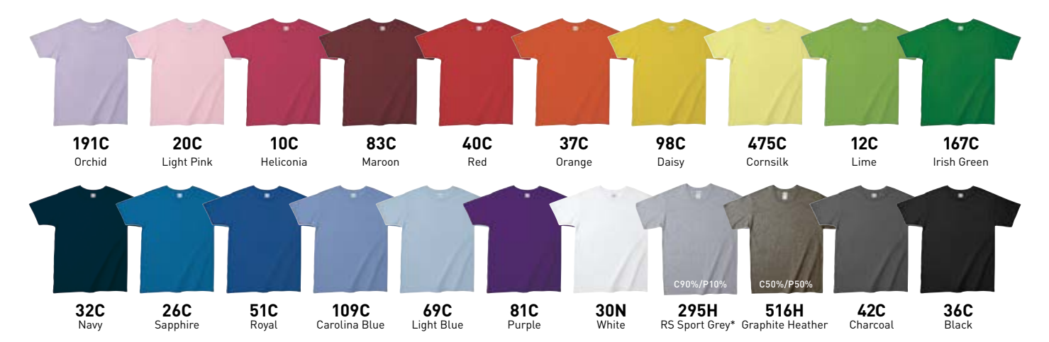
*C = % Cotton / P = % Polyester